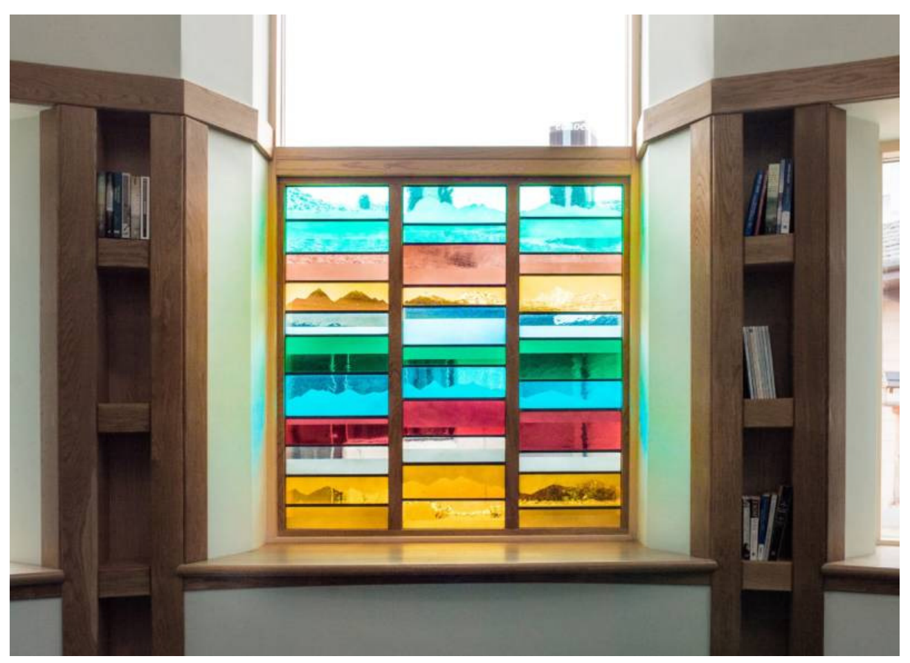
In the Visitors' Lounge the specific colours used by Erlend have been taken from the palette formulated by Donna Wilson and inspired by Glen Affric.

Black-Isled based visual artist Erlend Tait has designed three windows for the new buildings - two for the Visitors' Lounge and one for the Sanctuary. These have been created with different factors in mind and emphasis has been placed on using materials and colours to create beautiful features that enliven the spaces. The square window in the Sanctuary features the distinctive outline of the Coigach Mountains and in particular the shape of Suilven can be recognised.